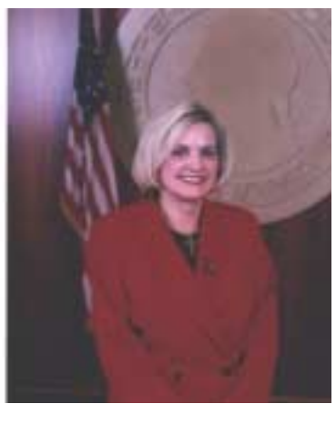
District 4 Commissioner Health & Human Services